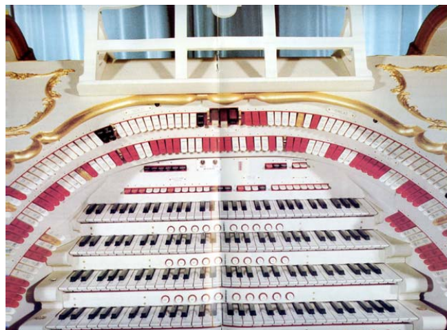
Stop Tab Horseshoe—Stockport Town Hall

The only question I have been asked (by two different people) since the last Newsletter is "What are those levers bobbing up and down in the middle of the top stop-rail? I think it is something to do with the volume."